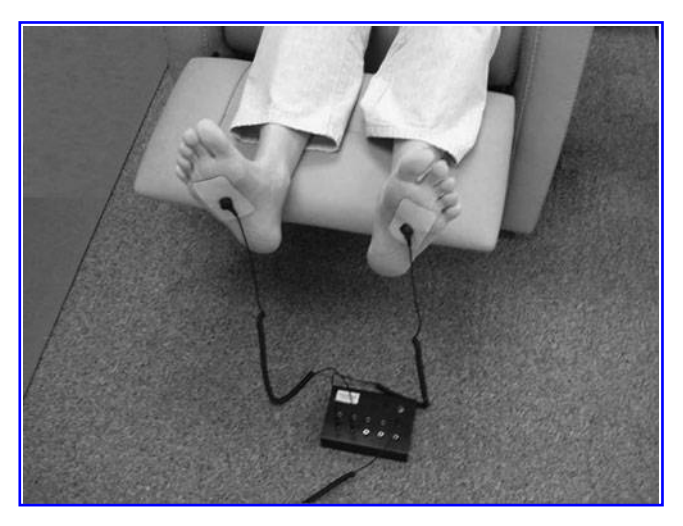
FIG. 1. Grounding system showing patches, wires, and box connecting to a ground rod planted outside through a switch (not shown) and a fuse (not shown). Similar patches and wires from the hands were also connected to the box to ground the hands.

For zeta potential calculations the Smoluchowski equation was used as follows<sup>27</sup>: